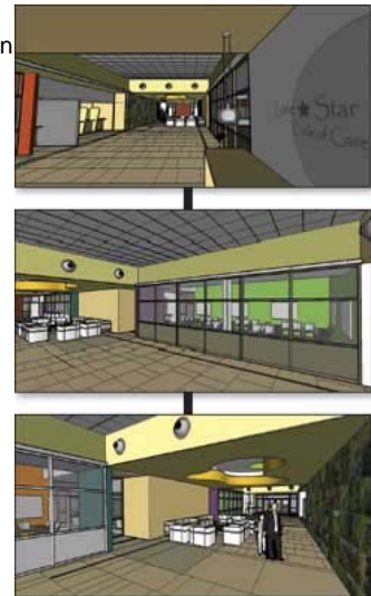
Renderings of the medical mall inside the Lone Star Circle of Care clinic hub